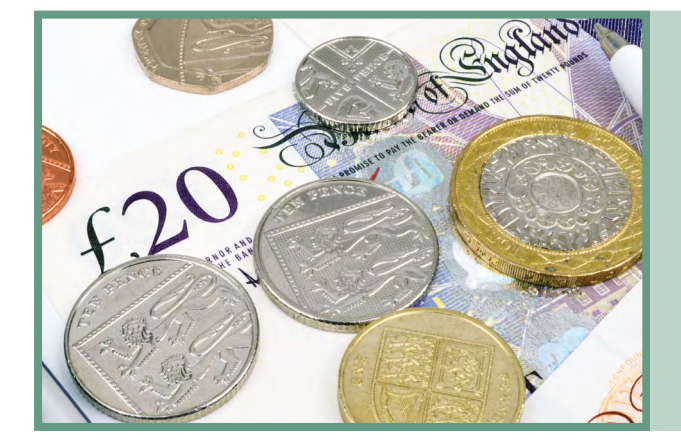
You may be able to get help with essential costs through your local council.