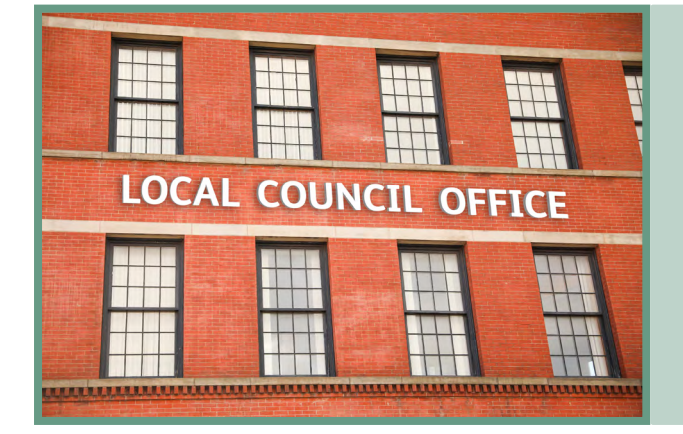
Your local council look after the funds for your area. They decide how to use the fund.